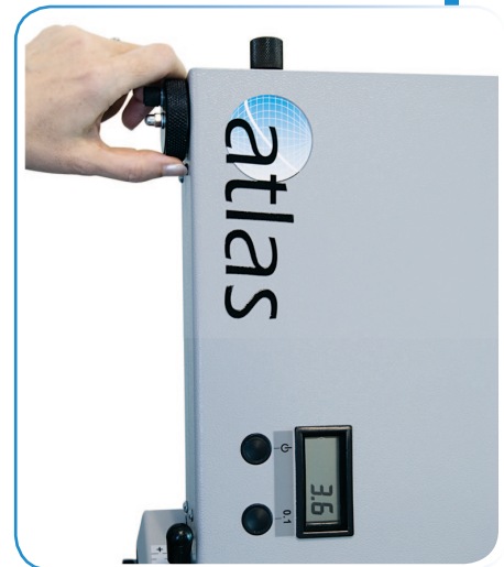
Fold adjustment knob and LCD readout