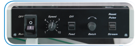
Easy-to-use control panel

* Speed varies depending on paper weight