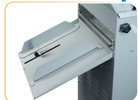
Perforation / score attachment, included

Formax - New Hampshire, USA www.formax.com