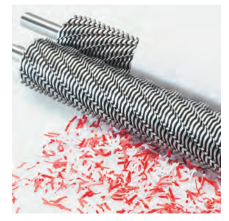
SOLID STEEL CUTTING SHAFTS High grade, hardened steel cutting shafts are milled in our Balingen factory and warranted for life.