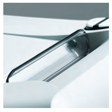
PATENTED SAFETY SHIELD Electronically controlled, transparent safety shield keeps fingers out of the feed opening.