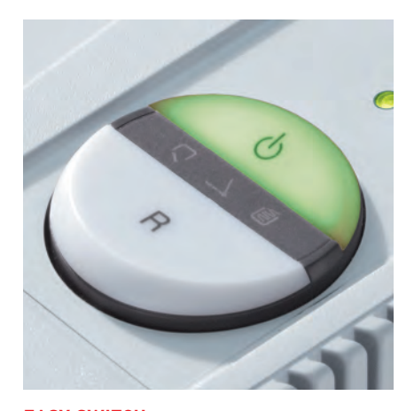
EASY SWITCH Multifunction control element uses optical signals to indicate operational status and functions as an emergency stop switch.