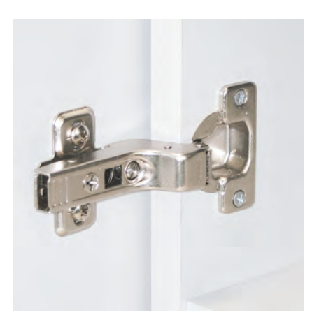
QUALITY COMPONENTS Cabinet doors are equipped with high quality adjustable metal hinges.