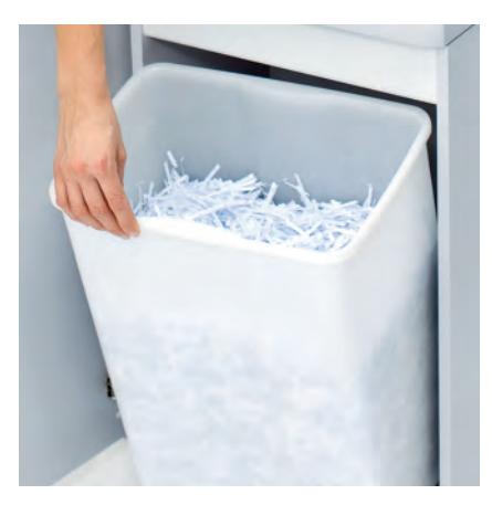
ENVIRONMENTALLY FRIENDLY BIN Durable, lightweight shred bins can be used with or without disposable bags.