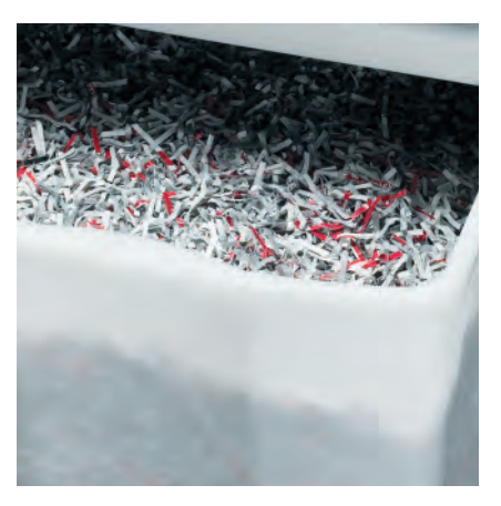
ENVIRONMENTALLY FRIENDLY BIN

On CD capable models, the electronically controlled shield protects the operator from stray splinters of plastic.