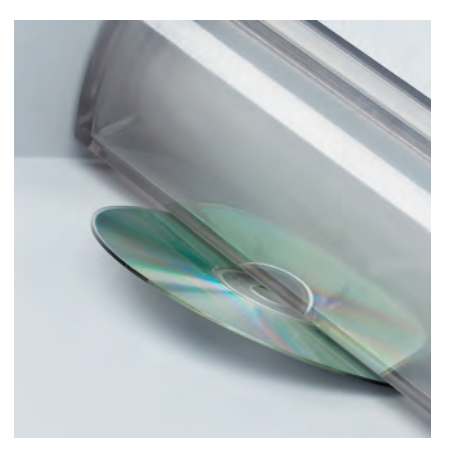
SAFE SHREDDING OF CDs / DVDs An electronically controlled, transparent safety shield protects the operator from stray splinters of plastic.