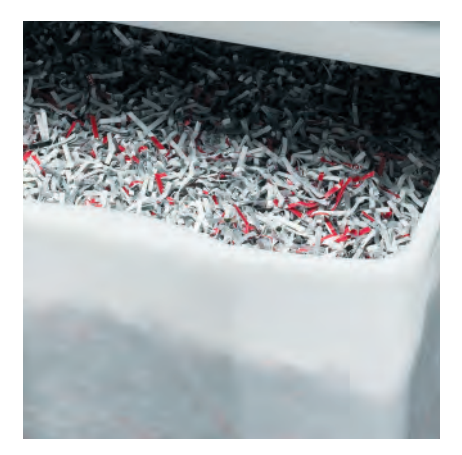
ENVIRONMENTALLY FRIENDLY BIN Durable, lightweight shred bins can be used with or without disposable bags.