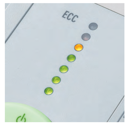
CAPACITY INDICATOR Patented Electronic Capacity Control (ECC) indicator monitors sheet capacity levels during operation to prevent jams.