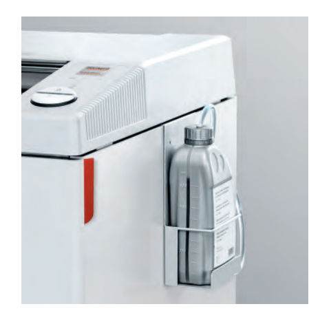
AUTOMATIC OIL INJECTION The cutting shafts are automatically lubricated while shredding, ensuring optimal performance.