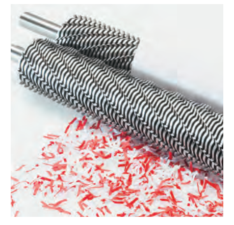
SOLID STEEL CUTTING SHAFTS

High grade, hardened steel cutting shafts are milled in our Balingen factory and warranted for life.