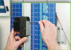
Cutting head carriage is field adjusted keeping head above material prior to cutting