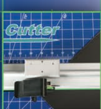
Table graphics aids in cutting angled substrates