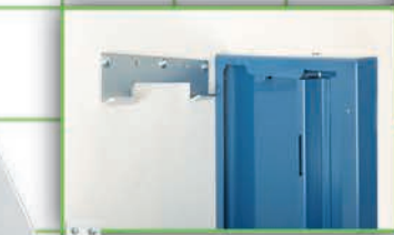
Wall-mount hanging set-up made easy by hooking table onto hanger