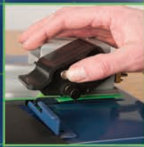
"Lock and Cut" feature – button reset