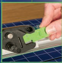
Knife Blade Cartridge easily and safely inserts into the cutting head