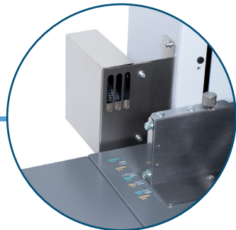
Side Air System Enhances feeding of heavy stock and large paper sizes