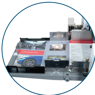
Extended Infeed Tray with Air Suction Handles sheets up to 25.5" long, using both optical and ultrasonic sensors