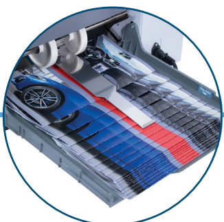
Outfeed Stacking Belt & Rollers Automatically adjusts to paper size, with two tray positions available