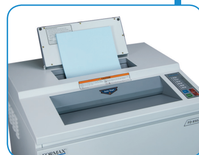
Dedicated AutoFeeder holds up to 175 sheets