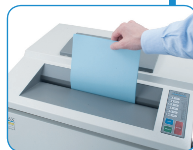
Standard Infeed accommodates up to 24 sheets at once