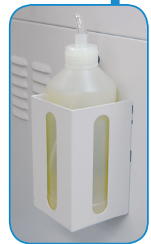
Optional EvenFlow™ Automatic Oiling System

BINDING & LAMINATING SOUTHWEST COME TOGETHER. RIGHT NOW.