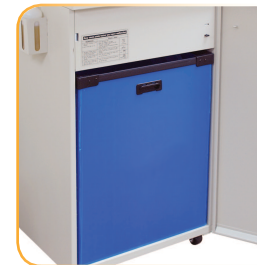
Heavy Duty Waste Bin