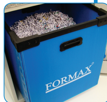
Lifetime Guaranteed Heavy-Duty Waste Bin