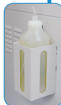
AutoOiler - Automatically pumps oil onto cutting blades