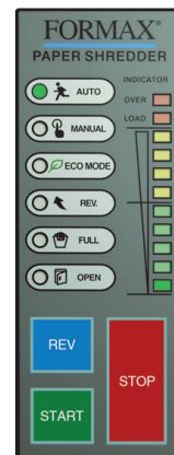
Easy-to-use control panel with Load Indicator and ECO Mode

Safety Circuit Breaker: Ensures safe operation