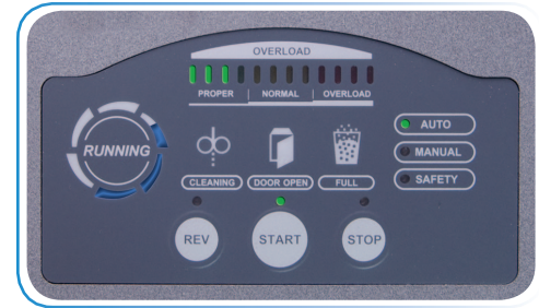
User friendly LED control panel with visual load indicator

* Sheet capacity may vary due to variations in paper and power supply.