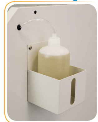
EvenFlow™ Oiling System Reservoir Bottle

BINDING & LAMINATING SOUTHWEST COME TOGETHER. RIGHT NOW.