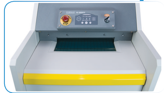
Large infeed table with conveyor belt, and safety bar for immediate shut down