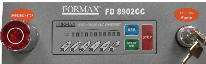
LED control panel with visual load indicator and safety key lock

The FD 8904B offers unmatched automated features through its LED control panel. The easy-to-read Load Indicator assists operators in determining how close they are to the maximum shred capacity to avoid jams and provide optimal efficiency. Operators can select from two modes of operation: Auto Start/Stop or Manual. Auto Start/Stop mode utilizes optical sensors which detect paper and start/stop operation automatically. Manual mode provides non-stop operation for shredding small sized paper or films. The Safety Key Lock prevents unauthorized use of the shredder.