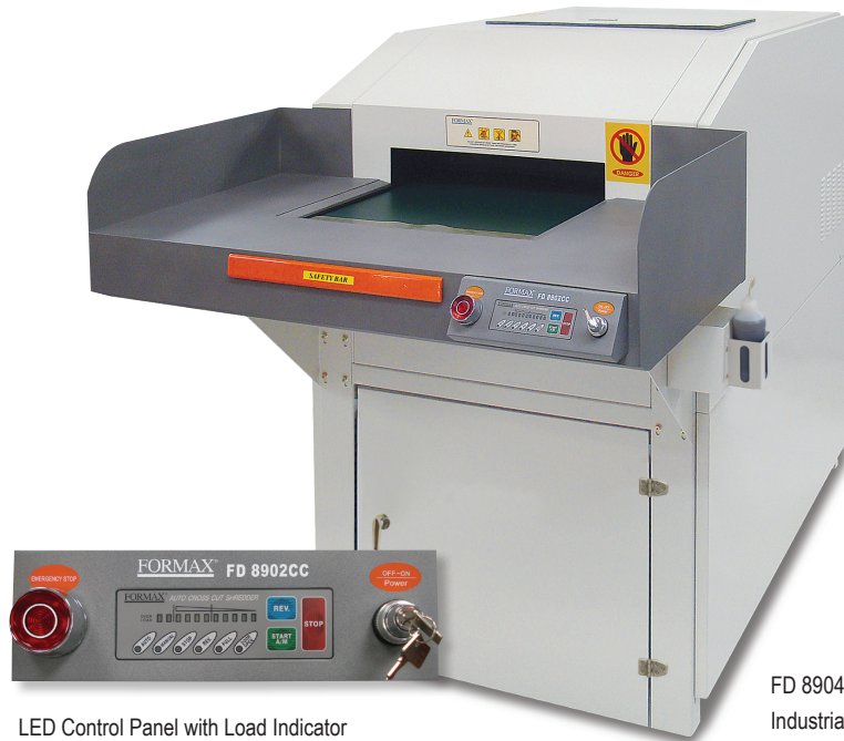
LED Control Panel with Load Indicator