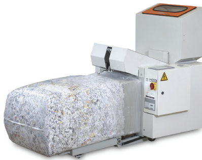
FD 8904B with full bale

The FD 8904B features a powerful high-capacity Output Baler which continually compacts shredded material into a bale, which improves throughput capacity by minimizing the frequency of unloading the shredder. Sensors automatically stop the shredding mechanism when the baler is full. The FD 8904B is the ultimate solution for high-capacity centralized shredding.