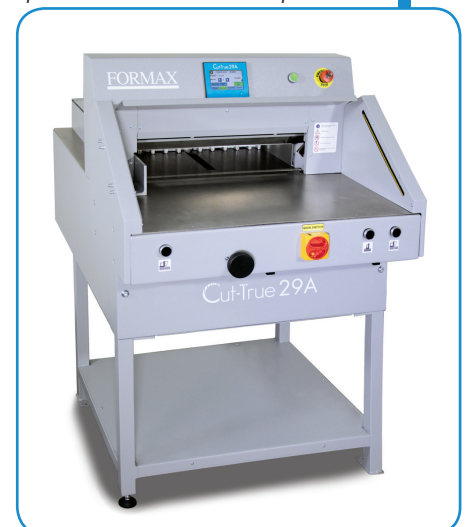
Standard model, without optional wide side tables

BINDING & LAMINATING SOUTHWEST COME TOGETHER. RIGHT NOW.