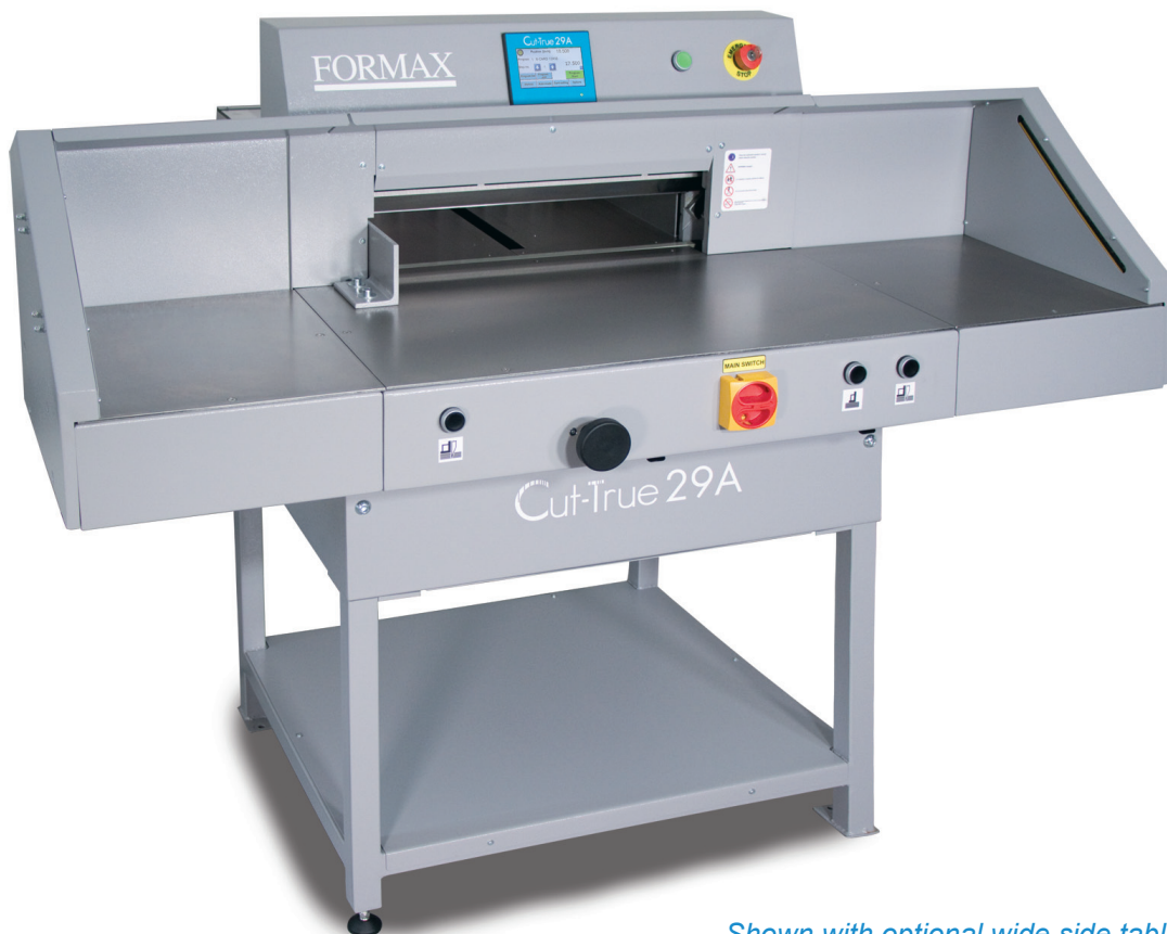
Shown with optional wide side tables

The Formax Cut-True 29A Electric Guillotine Paper Cutter offers precision cutting for paper stacks up to 20.5" wide. User-friendly, intuitive features include a touchscreen control panel, automatically-adjusting back gauge and the capacity to program up to 100 jobs/100 cuts . An infrared light beam safety curtain provides safety and convenience as it shuts down operation if the light plane is interrupted.