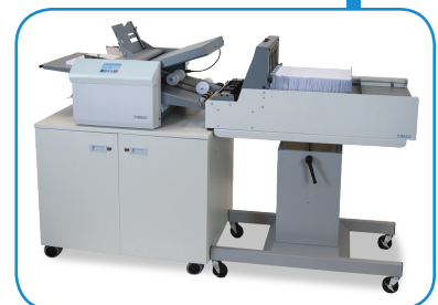
FD 386 in-line with optional V-Stack36i Vertical Stacker, multi-sheet feeder, stand and cabinet

BINDING & LAMINATING SOUTHWEST COME TOGETHER. RIGHT NOW.