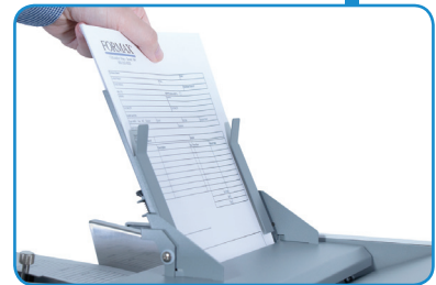
Optional Multi-Sheet Feeder