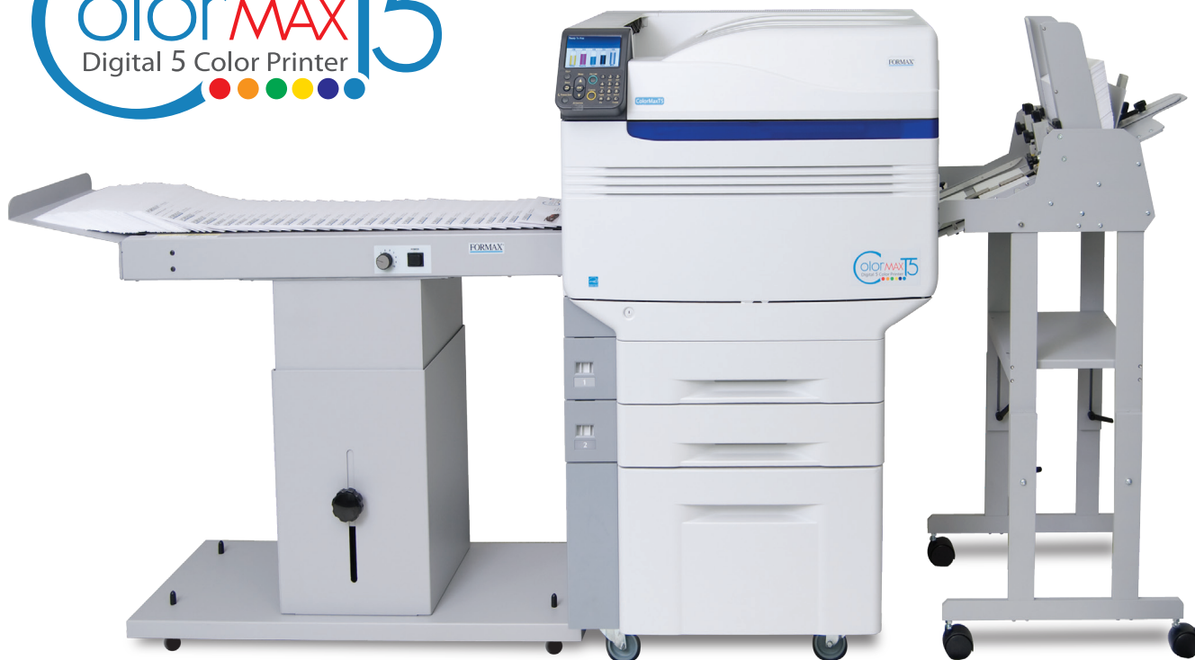
ColorMaxT5 System: Digital 5-Color Printer, Output Conveyor and Envelope Feeder